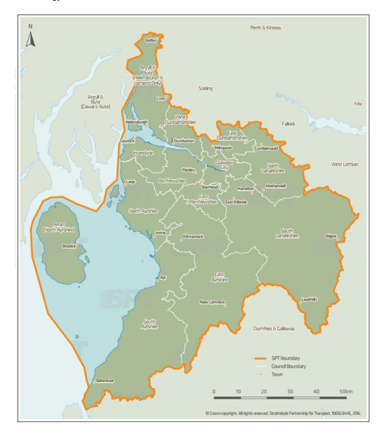
The SPT area covers 7000 sq. km and is home 2.21 million people living in 194 localities.

Strathclyde Partnership for Transport (SPT) is the Regional Transport Partnership<sup>1</sup> for the west of Scotland and is made up of twelve councils: East Dunbartonshire, East Ayrshire, East Renfrewshire, Glasgow City, Inverclyde, North Ayrshire, North Lanarkshire, Renfrewshire, South Ayrshire, South Lanarkshire, West Dunbartonshire and the Helensburgh and Lomond area of Argyll and Bute.