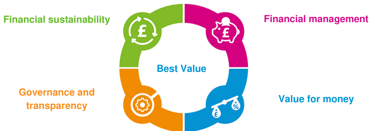
Exhibit 1: Audit Dimensions within the Code of Audit Practice