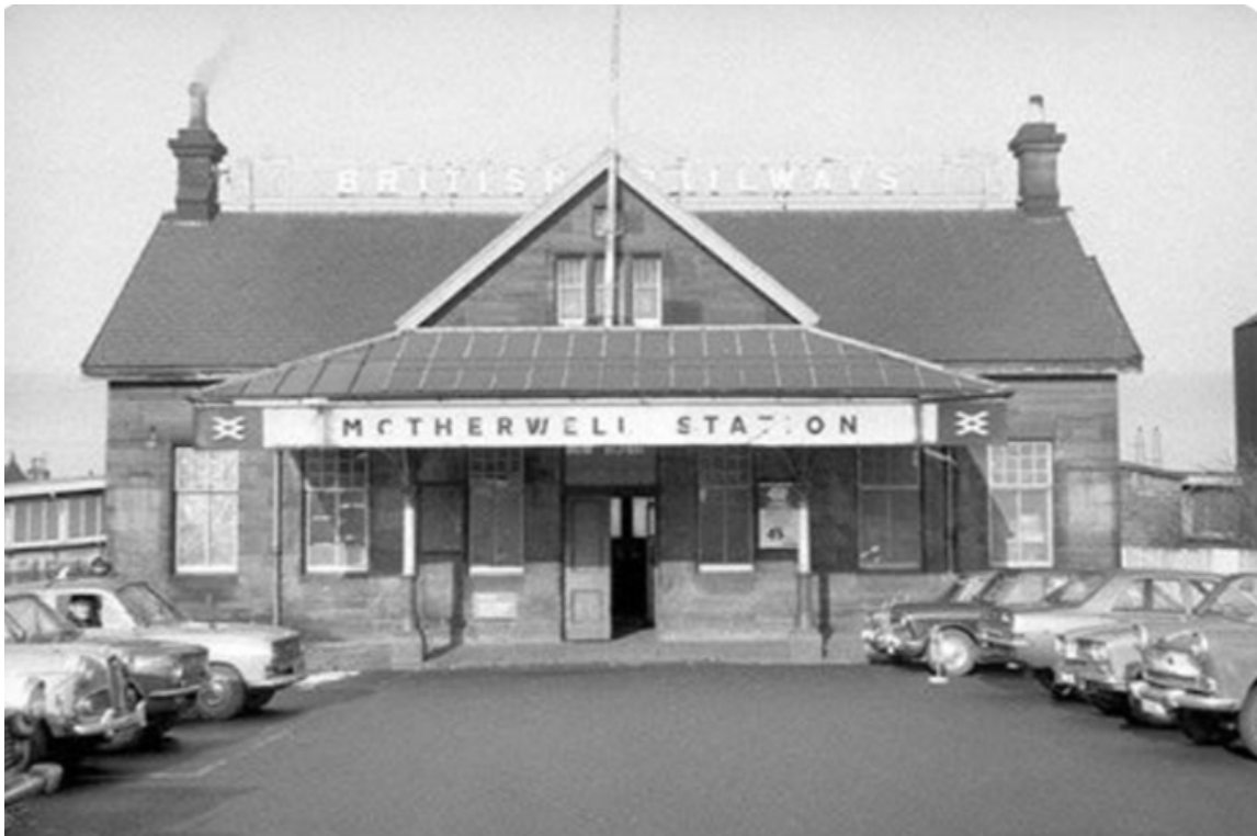
Station entrance c.1967