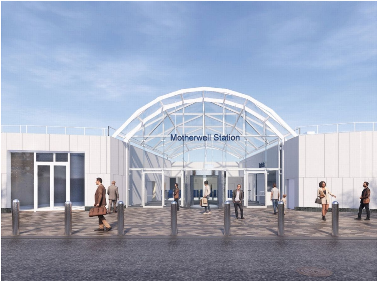
Visual of station entrance when completed