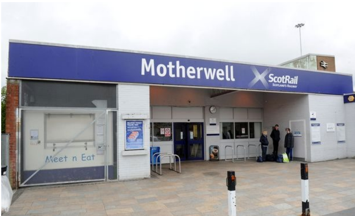
Station Entrance (Before)