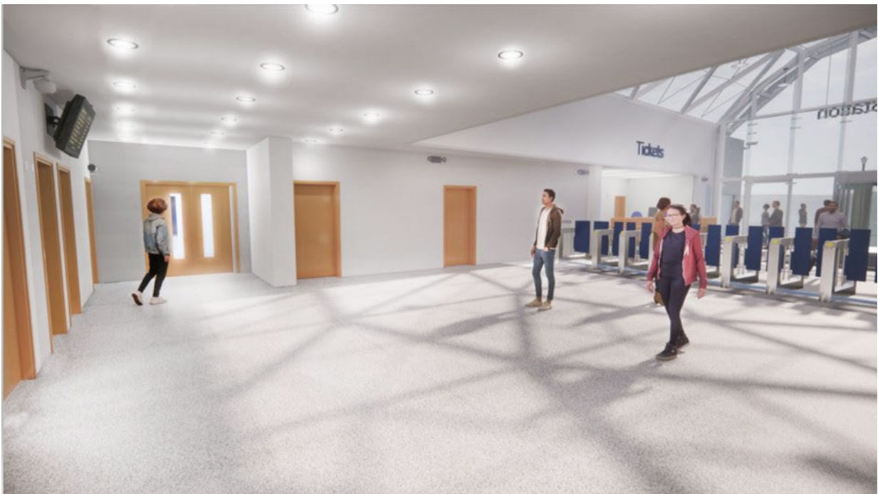
Visuals of new widened concourse with new travel shop, gateline, retail unit, glazed roof